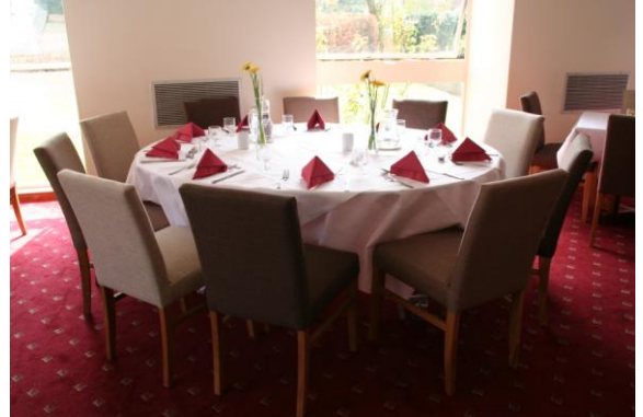
Dining hall, University of Birmingham