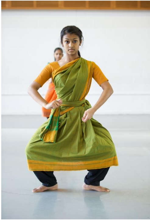
Image: CAT workshop at DanceXchange

Recommended study per week additional to CAT classes/residencies: