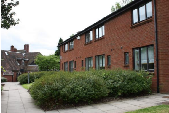
Conference park accommodation, University of Birmingham

students from the DanceXchange studios to the accommodation, about a 20min journey. Students get a breakfast and a two course evening meal included in the accommodation. The students are allocated twin rooms which encourages support between fellow students.