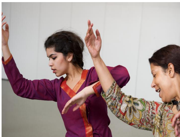
Image: CAT workshop at DanceXchange

The South Asian strand attends intensive residential courses in Birmingham during half terms and summer holidays. Students who will potentially be travelling from across the country will be supervised by CAT staff/chaperones and accommodation will be provided. Students are expected to fund their travel costs.