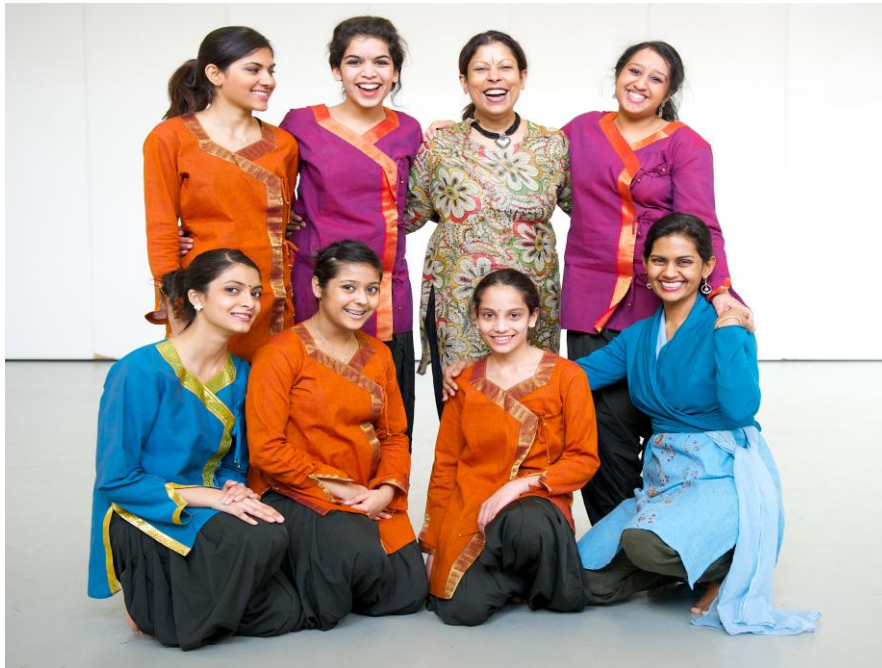
Image: CAT workshop at DanceXchange

Please note that these dates are not confirmed, when a student is selected and offered a place on the CAT a Student Handbook will be sent out with full details of the term dates and residential projects.